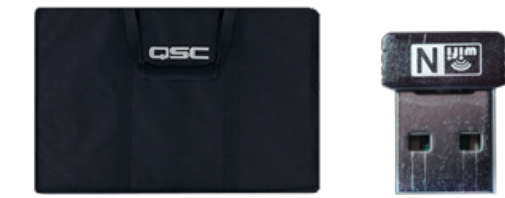
Included carry-case and Wi-Fi dongle