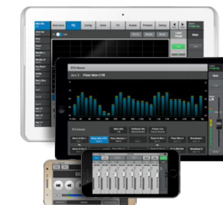
TouchMix Control App for iOS® and Android® devices

The TouchMix-30 Pro includes two real-time analyzers (RTA). One RTA may be displayed along with the equalizer of any currently selected input or output channel. A second, independent RTA may be assigned to display the audio signal of any output, the Cue buss or the Talkback microphone input. TouchMix-8/16 models include a single RTA.