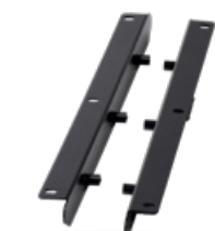
Rack-Mounting Kit for TouchMix-30 Pro