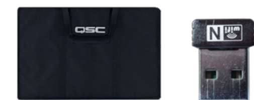
Included carry-case and Wi-Fi dongle