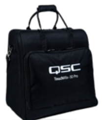
TouchMix-30 Pro Tote