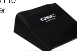
TouchMix-30 Pro Dust Cover