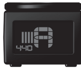
OUT OF TUNE (red color)