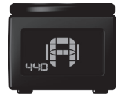
IN TUNE (green color)

FOR LANGUAGE TRANSLATIONS, VISIT PLANETWAVES.COM