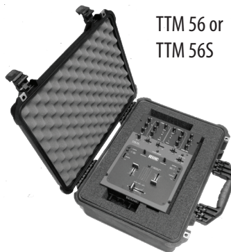
TTM 56 or TTM 56S