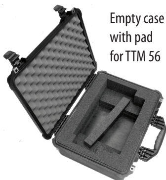
Empty case with pad for TTM 56