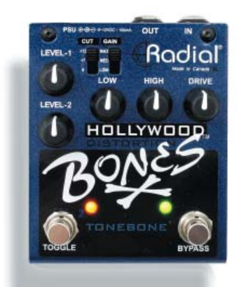
Hollywood Bones order # R800 7100

For maximum on-stage efficiency, the Hollywood is configured for clean, rhythm & lead playability. In bypass mode, you get the natural clean sound of your guitar. When the Hollywood is activated, you can choose between two output drive circuits using the toggle footswitch. Each is equipped with a variable level control so that LEVEL-1