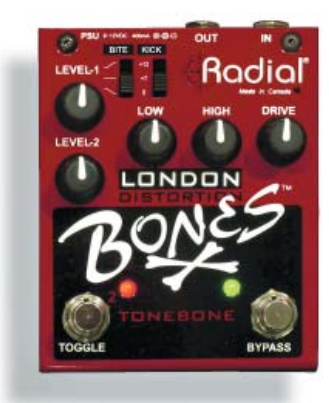
London Bones order # R800 7105

For maximum on-stage efficiency, the London is configured for clean, rhythm & lead playability. In bypass mode, you get the natural clean sound of your guitar. When the London is activated, you can stomp between two variable LEVEL controls. Use LEVEL-1 to set a