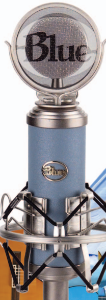
The Bluebird is shown with the BirdNest (pop filter) and BirdCage (shockmount)

In order to familiarize yourself with the Bluebird's specialized and unique features, please take the time to read this manual and be sure to try the suggested recording tips. With proper care and use, the Bluebird will reward you with many years of recording enjoyment. Unlike other bluebirds you may know of, this one requires no feeding and there's no mess to clean up!