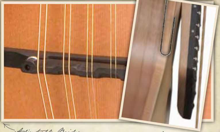
Adjustable Bridge Floating Fingerboard Extension