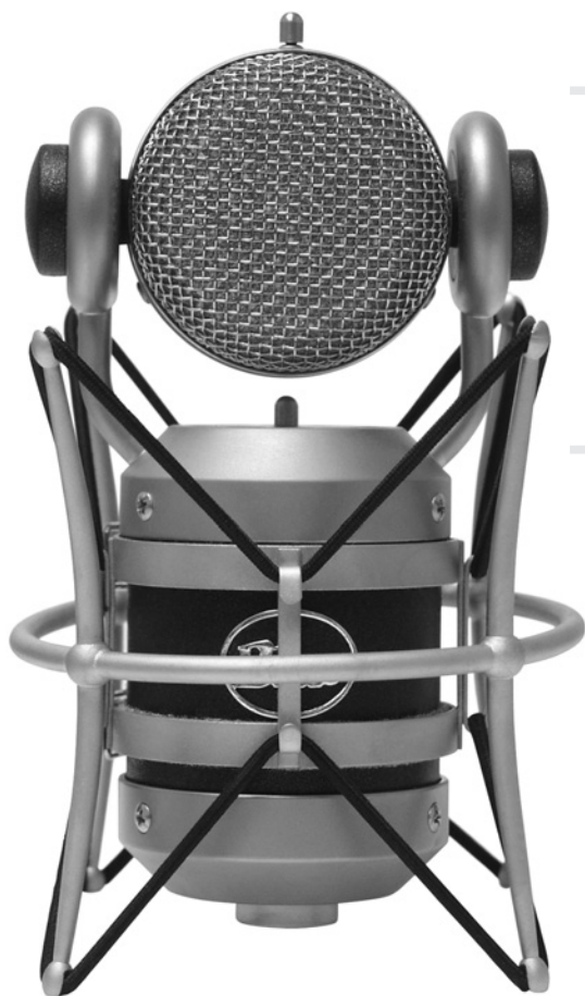
Mouse with The Shock

The mouse comes with its own custom-built shockmount, The Shock , as an included accessory. Along with this external mounting, complete internal shockmounting is built